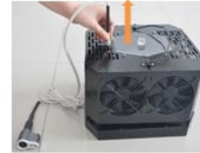
3) Pull out