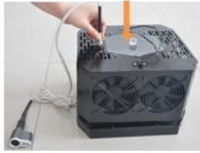
2) Align and insert