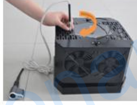
3) Clockwise rotate to lock