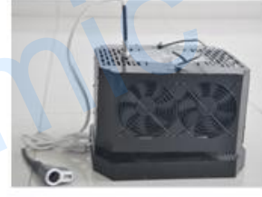
4) Completed installation