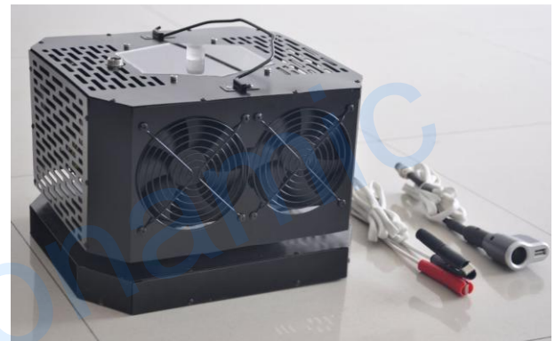
The 50W generator comes with the wire for the outputs: 12 VDC car lighter adapter, 5 V USB, and 14 V for deep battery charger