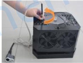
2) Anticlockwise rotate to unlock