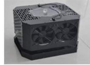
4) Completed disassemble