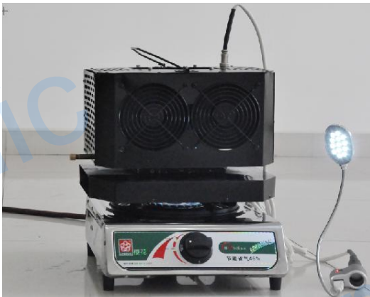
Put the generator on top of the heater to generate free electricity

Patent No.: ZL 2011 2 0010954.2, ZL 2010 1 0219930.8, ZL 2010 2 0252414.0